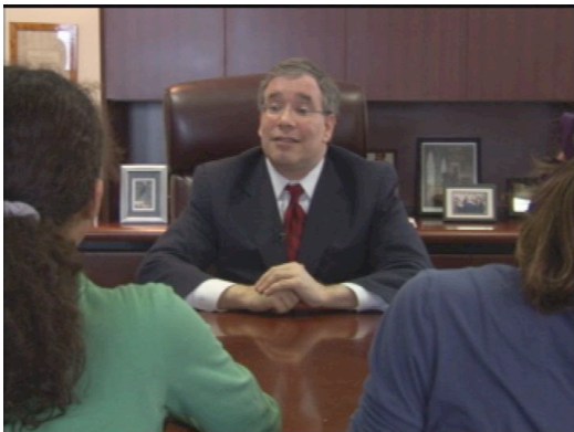
Manhattan Borough President Scott Stringer